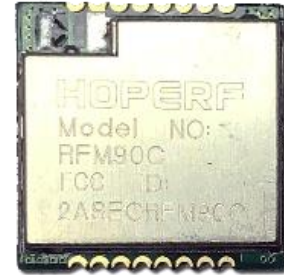
Picture1: RFM90CW Appearance

RFM90CW sub-GHz radio transceivers are ideal for long range wireless applications. It is designed for long battery life with just 8mA of active receive current consumption. It can transmit up to +22dBm with highly efficient integrated power amplifiers. These devices support LoRa® modulation for LPWAN use cases and (G)FSK modulation for legacy use cases. The devices are highly configurable to meet different application requirements utilizing the global LoRaWAN™ standard or proprietary protocols. The devices are designed to comply with the physical layer requirements of the LoRaWAN™ specification released by the LoRa Alliance™. The radio is suitable for systems targeting compliance with radio regulations including but not limited to ETSI EN 300 220, FCC CFR 47 Part 15, China regulatory requirements and the Japanese ARIB T-108. Continuous frequency coverage from 150 MHz to 960 MHz allows the support of all major sub-GHz ISM bands around the world.